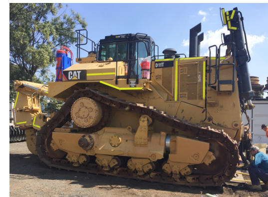
Shown lifting a CAT D11 Dozer, the New DURAPAC dozer jack has been designed with safety in mind.

***Maximum lift height for AS/NZS 2538:2004 Vehicle Support Stand Rating when using a 400mm extension