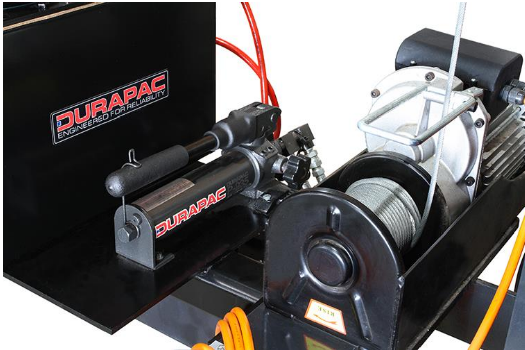
Figure 3 – Press Frame Lock